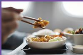
Try our signature Chinese dishes