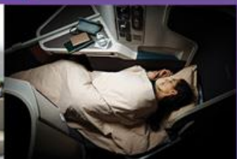
Upgrade to Business class